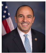
Representative Jimmy Panetta (D-CA 20th District)

The Members of Congress (MoC) Watchdogs issue group developed this newsletter to help you track your MoCs. Various sources, including VoteSpotter , Countable , GovTrack , VoteSmart , and FiveThirtyEight , were used in the creation of this newsletter. We reached out directly to the MoC offices when we needed further clarification or information that could not be found through our sources. If you'd like to contribute or provide some feedback, please e-mail our editors at indivisibleca20@gmail.com .