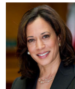
Senator Kamala Harris (D-CA)

Representative Anna Eshoo was born in New Britain, CT of Assyrian and Armenian heritage. She is a mother of two young adults and graduate of Canada College. She served on the San Mateo County Board of Supervisors for 10 years until she was elected to the U. S. House of Representatives in 1992.